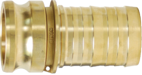
C38000 forged brass