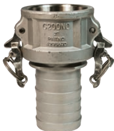
316 stainless steel