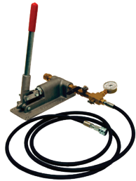
hand hydrotest pump HHTP