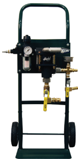
pneumatic hydrostatic test pump PTP